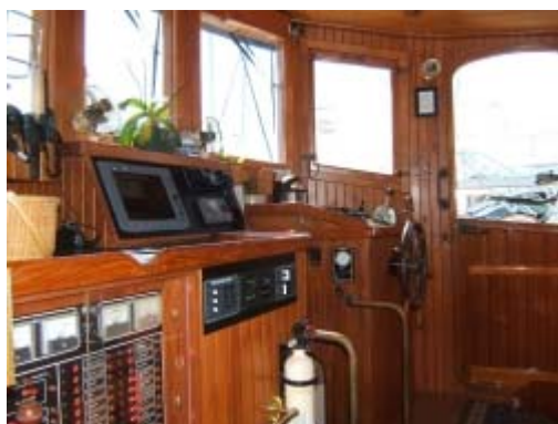
Pilot house fwd.

is turn-key ready and awaits her new owners to continue her cruising portfolio. ( New preliminary listing more to come)