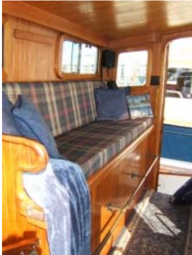
Pilot house aft