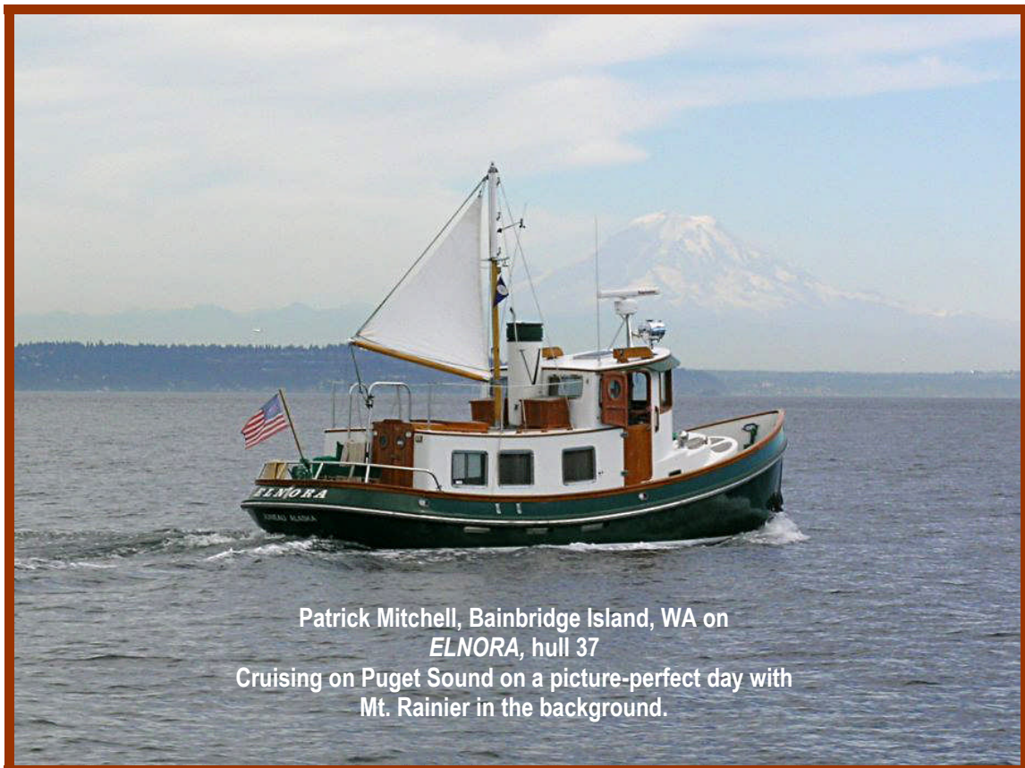
Patrick Mitchell, Bainbridge Island, WA on ELNORA , hull 37 Cruising on Puget Sound on a picture-perfect day with Mt. Rainier in the background.

LNT Newsletter Macy Galbreath 214 Eagle View Lane Port Ludlow, WA 98365