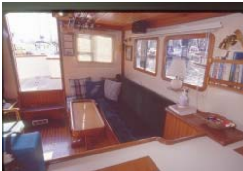
Salon aft, port settee