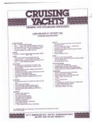
Builders specification (To print save as JPEG then print)