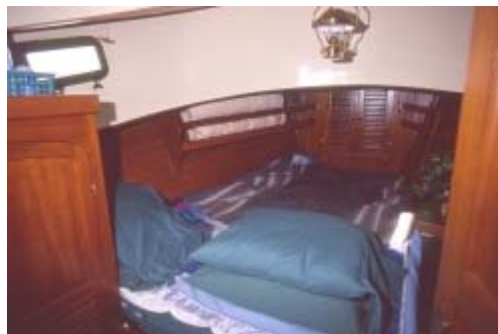
Fwd stateroom berth