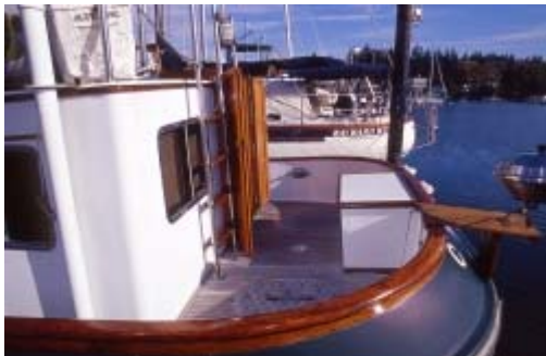
Cockpit, Gen-set box