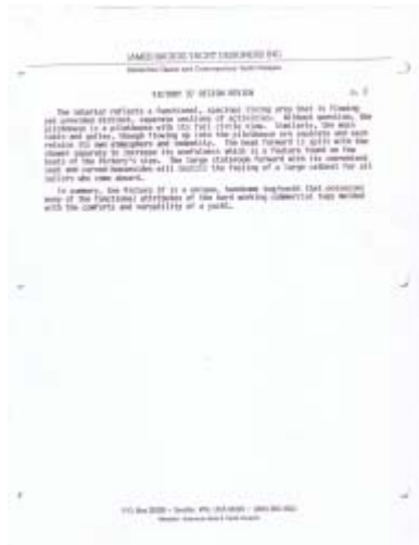
Design review p.2 (To print save as JPEG then print)