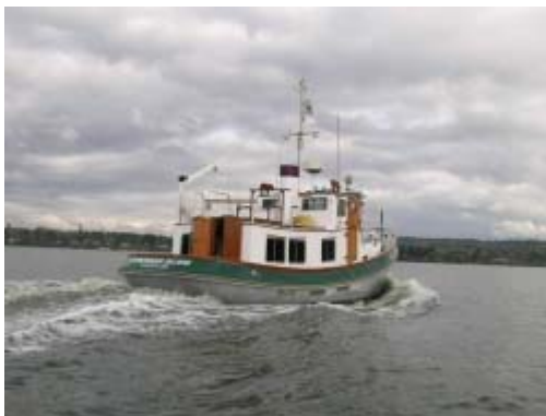
Stern under away