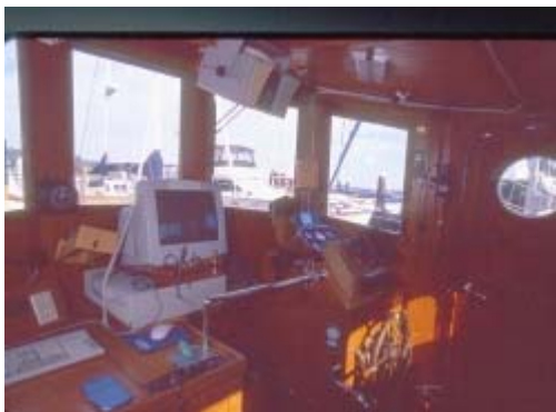
Pilothouse to stbd