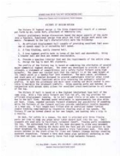
Design review p.1 (To print save as JPEG then print)