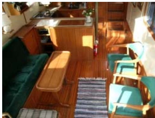
Salon fwd 2