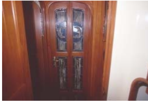
Dolphin doors to shower