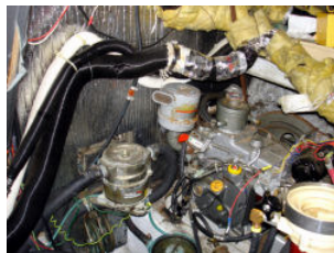
Yanmar gen set