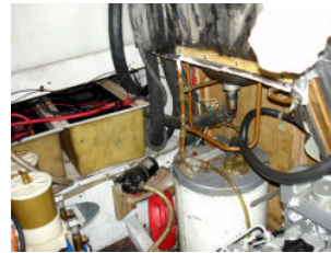
Engine room port side