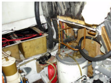
Engine room port side