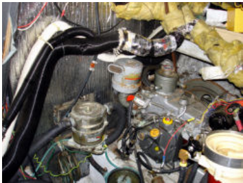
Yanmar gen set